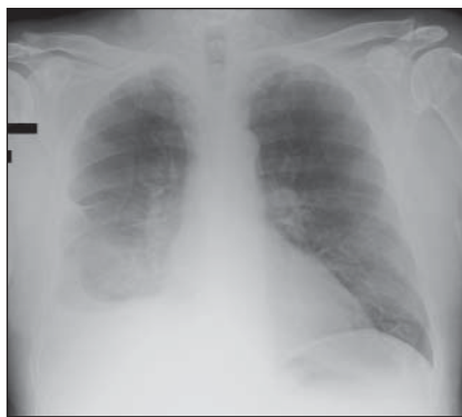
Figure 1. Chest Radiograph of Right-Sided Pleural Effusion

patients to say neun-und-neunzig to evoke fremitus over the thorax and the English translation is ninety-nine . However, it is recommended that patients use the sound “oy” because it is believed to better transmit low-pitched vibrations than ninety-nine . 29 The intensity of the vibration bilaterally over all lung fields should be observed. In normal lung physiology, low-frequency sounds are easily transmitted but high-frequency sounds are filtered. Large pleural effusions, however, reduce the transmission of low-frequency sounds, resulting in decreased tactile fremitus. The differential diagnosis of decreased tactile fremitus includes bronchial obstruction, pneumothorax, and pleural thickening. Increased tactile fremitus is suggestive of consolidation.